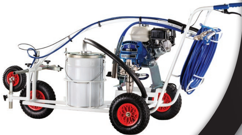
GMax II 3900