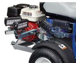
Break-A-Way Light System