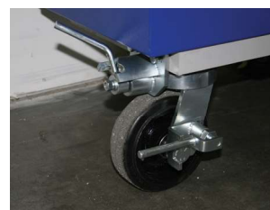
Rear Wheel System with release and brake.