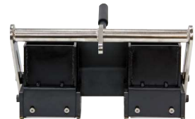
4 in x 4 in x 4 in SmartDie II