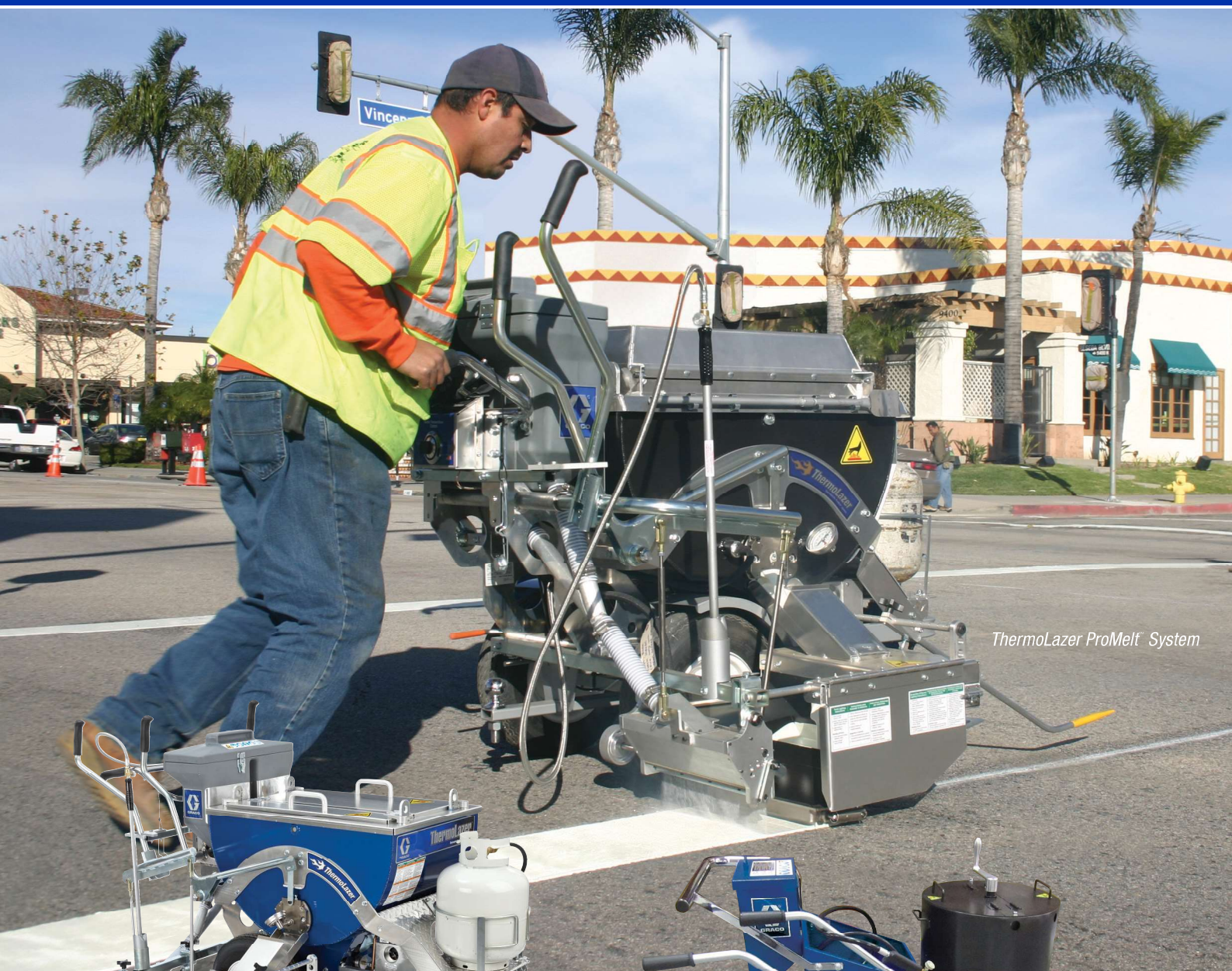
ThermoLazer ProMelt System