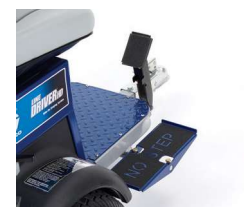
Dual Foot Pedal System (Patent 6,883,633)