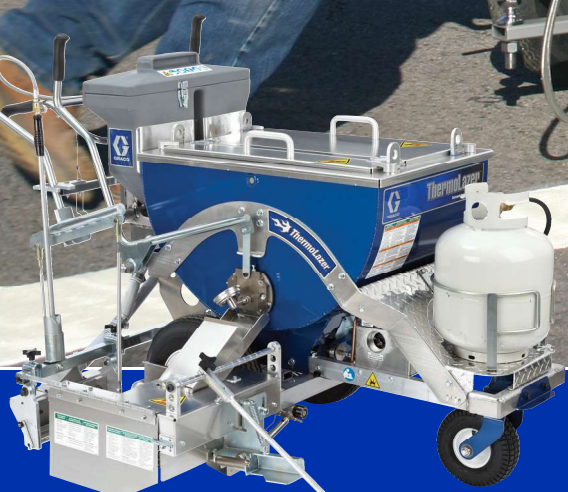
ThermoLazer 300rc System