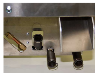
Tri-Flame Die Heat System