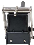
4 in SmartDie II

These hardened steel dies with an innovative, built-in mil adjustment system are built to last—exactly what you've come to expect from Graco.