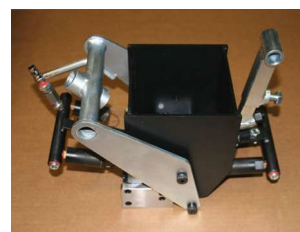
FlexDie—Steel die built to last!