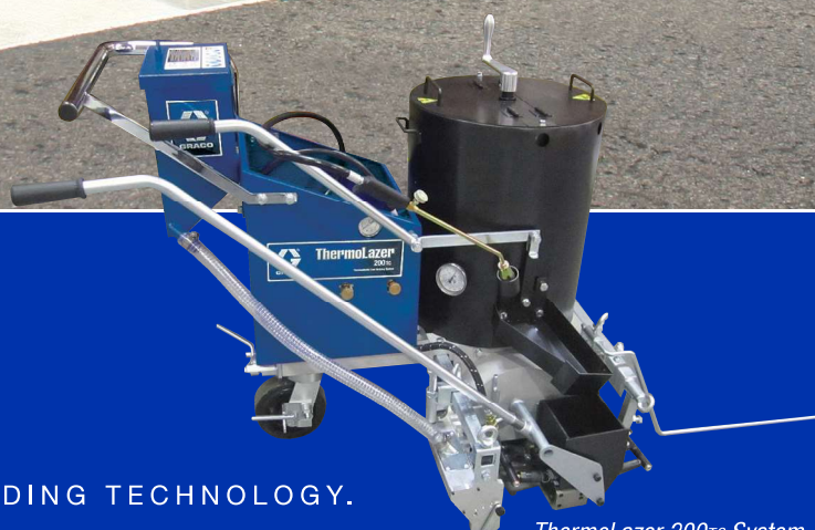
ThermoLazer 200rc System