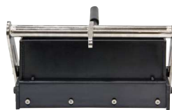
12 in SmartDie II