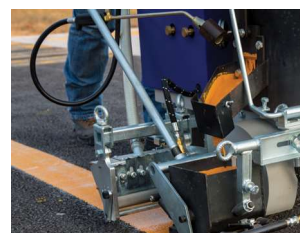
Excellent line quality.